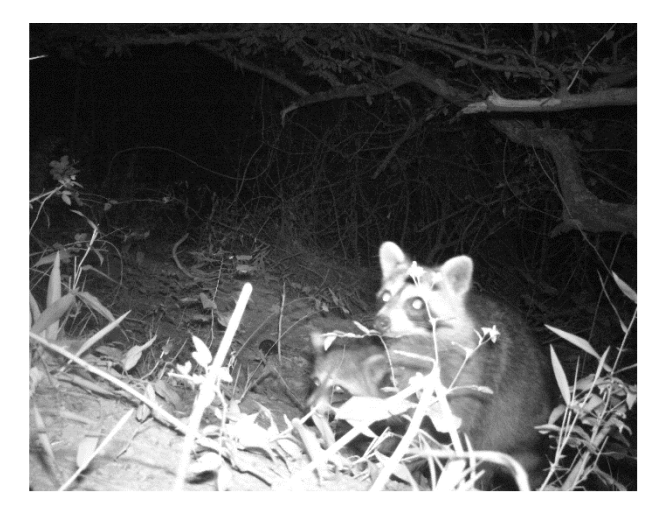
Figure 3. Late season mating of P. lotor in an urban system located in east Texas.

Mating appears to have started on the site near the end of Sep. with the earliest occasion occurring 26 Sep. (Fig 3). The latest occasion of mating occurred on 27 Feb. There were two occurrences of mating in Oct. on the first and fourth. The occurrence on 1 Oct. showed one individual mounted on a second with a third individual ca . 7 m away. All other multiple occurrences of raccoons in a picture were of individuals foraging or moving between locations.