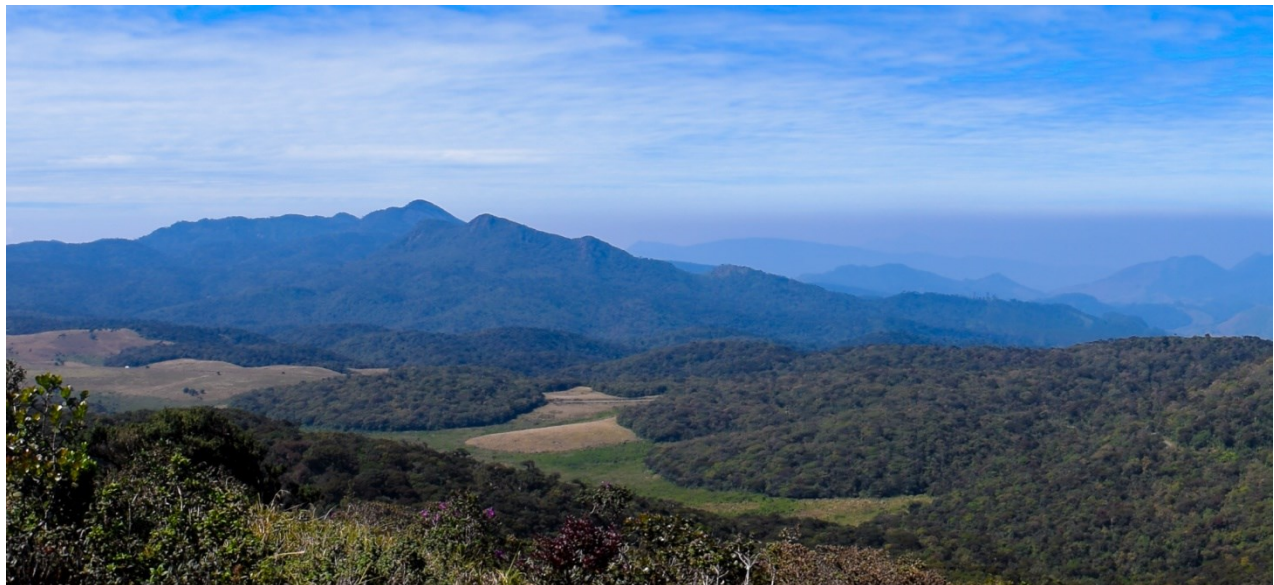
Figure 2. View of the central region of HPNP from the top of Totupola mountain. Grassland habitat and Cloud forest habitats are visible with the backdrop of Kirigalpoththa and Agra mountain ranges

Distance sampling is a popular method for density estimates of different animals (Jenkins et al. 1999, Karsten et al. 2009) and recent literature includes several studies of chameleons (Jenkins et al. 1999; Karsten et al. 2009) as well as a few agamid density estimations (Venugopal 2010). The natural