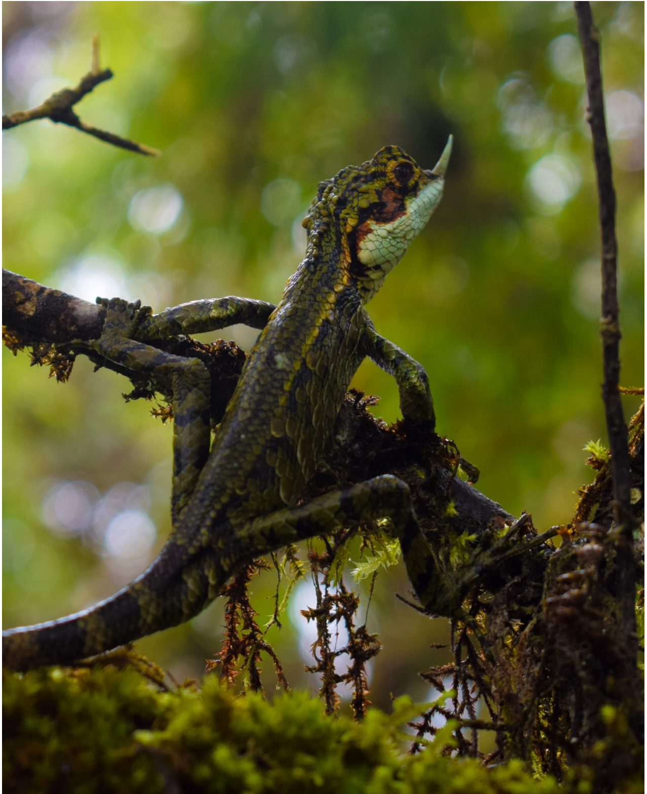
Figure 4. An adult C. stoddartii camouflaged in its preferred Cloud forest microhabitat